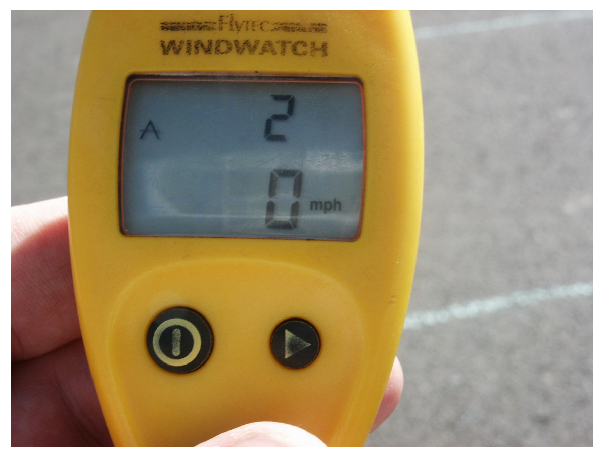
Figure 5 Wind Meter (2mph average, 0 at this time)