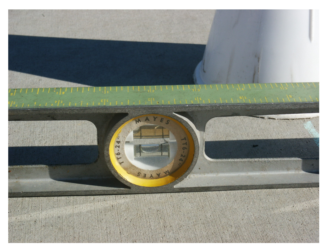
Figure 3 Bubble Level (sample from 50-cone course)