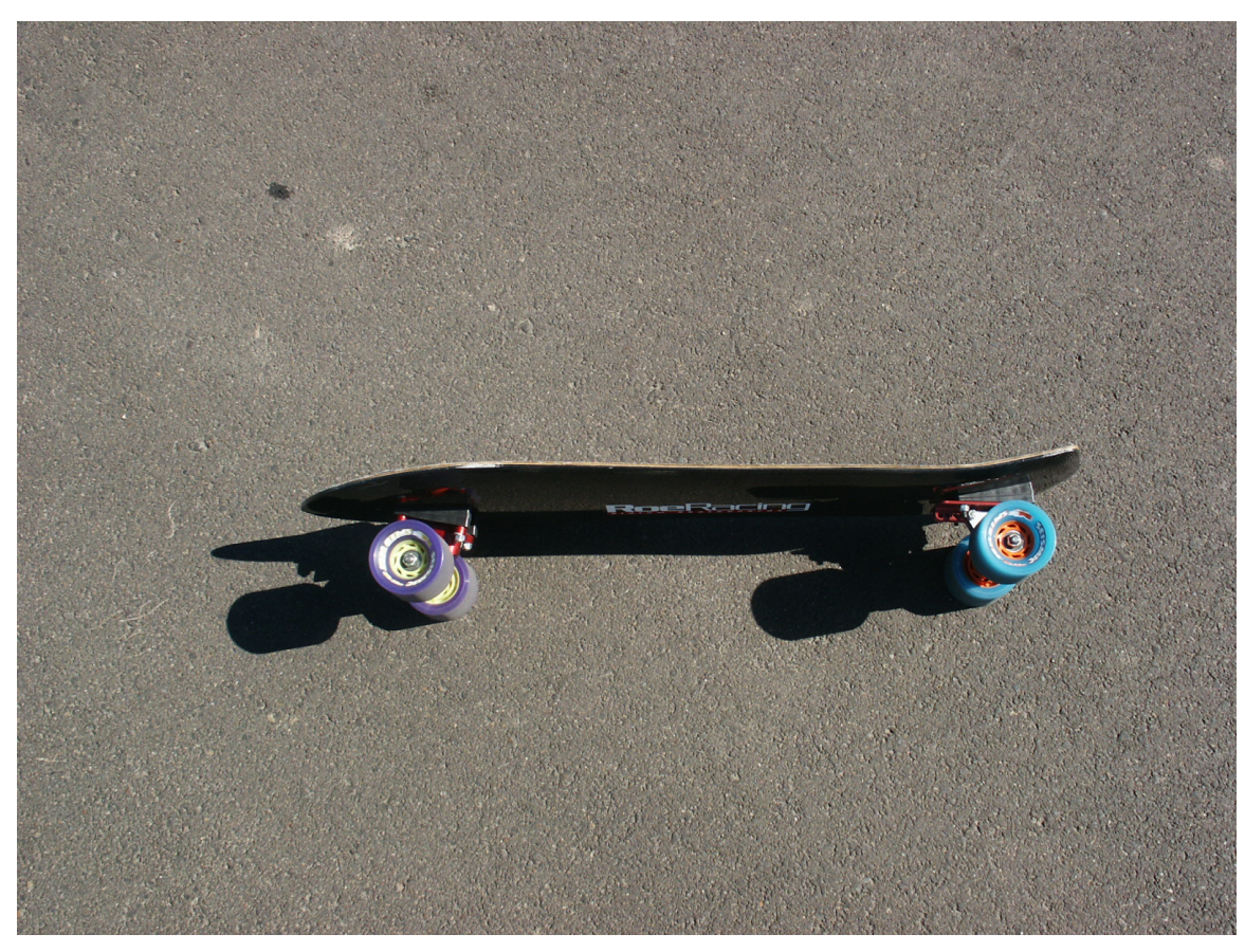
Figure 6 The skateboard