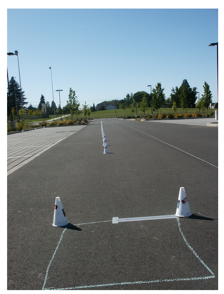
Figure 4 25-cone course looking South