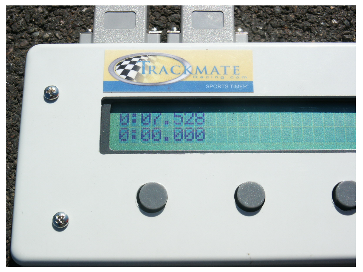
Figure 1 7.528 seconds -- going South in course.

Timer : Trackmate version 6.3 Tape switch actuated at start box boundary Distances: Tape measure Flatness: Bubble Level Wind: Flytec Windwatcher Cones: Seismic standard cones.