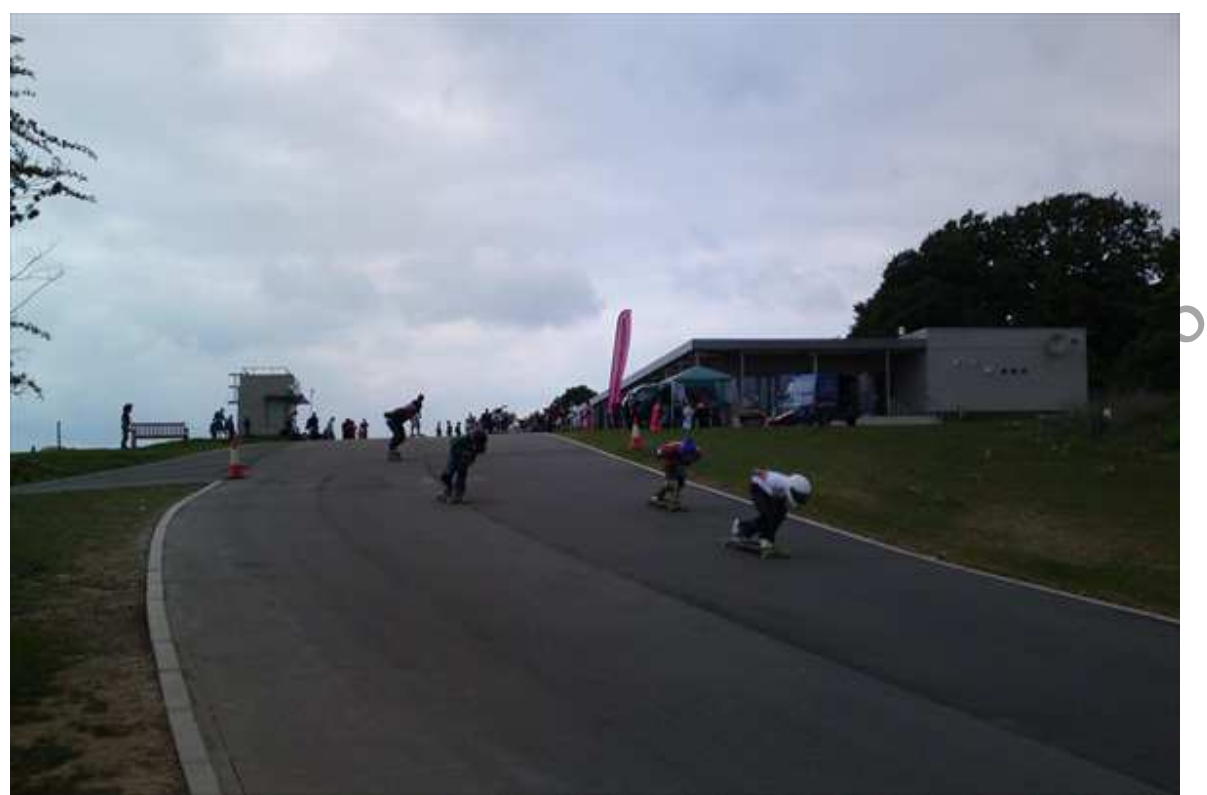
Second Hill – possibly to be used for free riding, sliding and Downhill "lite" when Hybrid and Tight are being run.